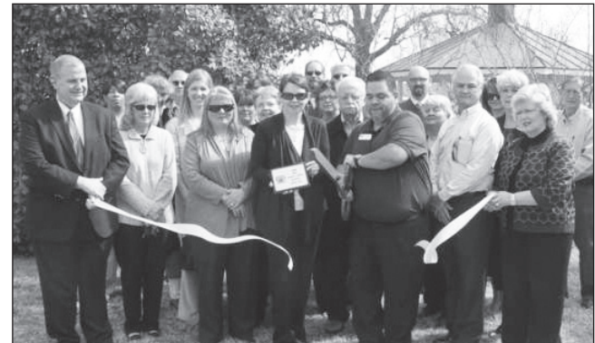
Parkland Community Health Plan