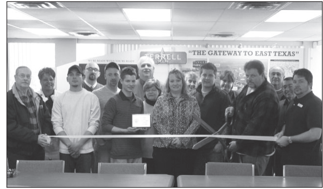
Carroll's Ace Glass & Mirror, Inc.