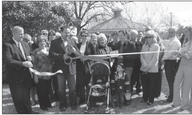
AMEX Electric Services