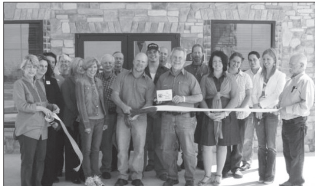
Master Autobody of Terrell