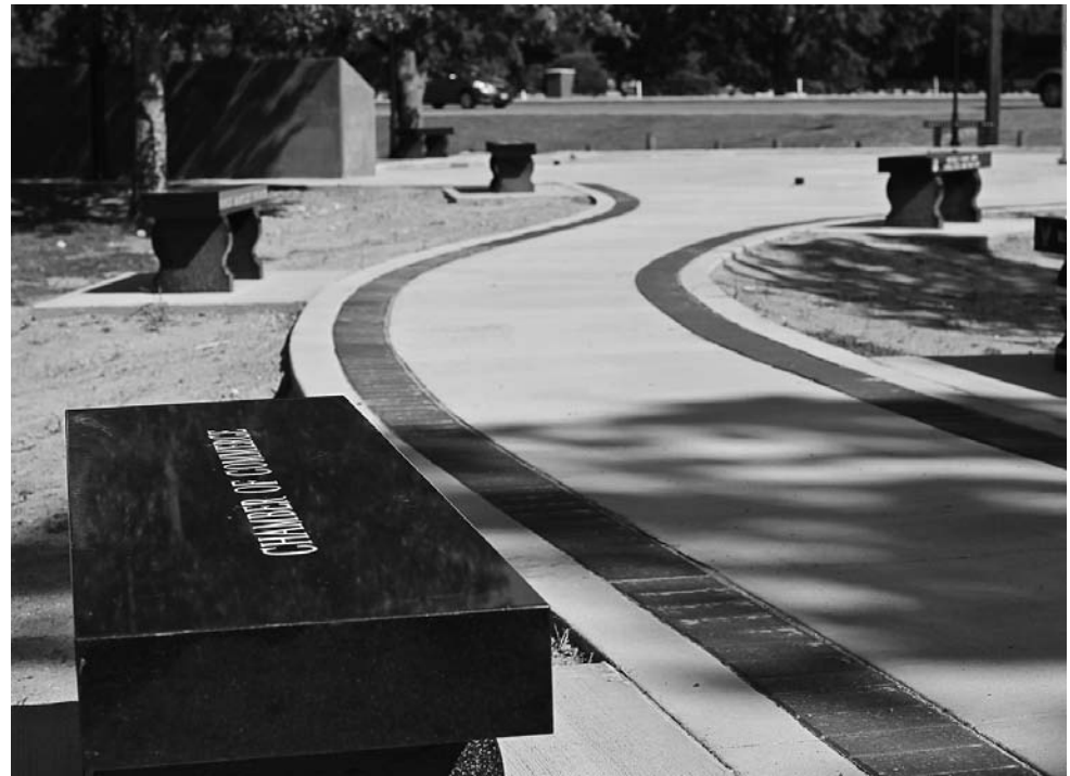
A dedication ceremony is planned May 30 for the Terrell Veterans Memorial Park.