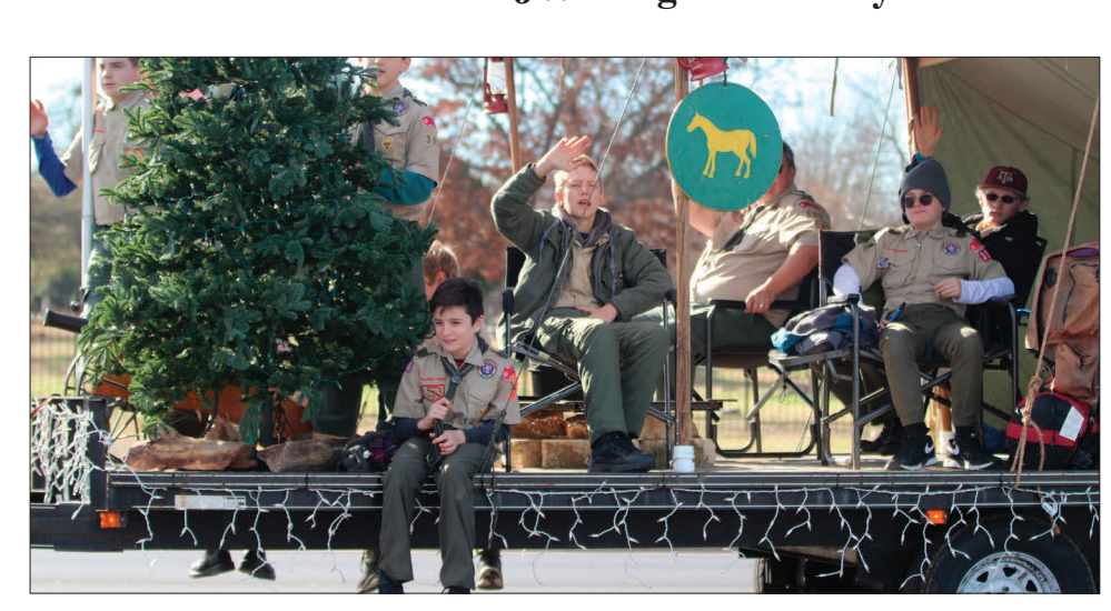
Junior Division - 1st Place - Boy Scouts Troop 390