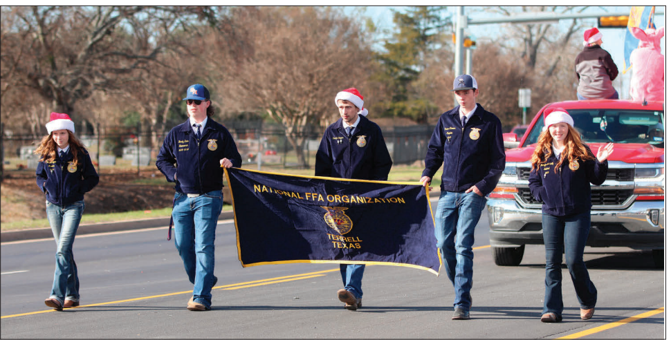
Junior Division - 3rd Place - Terrell FFA