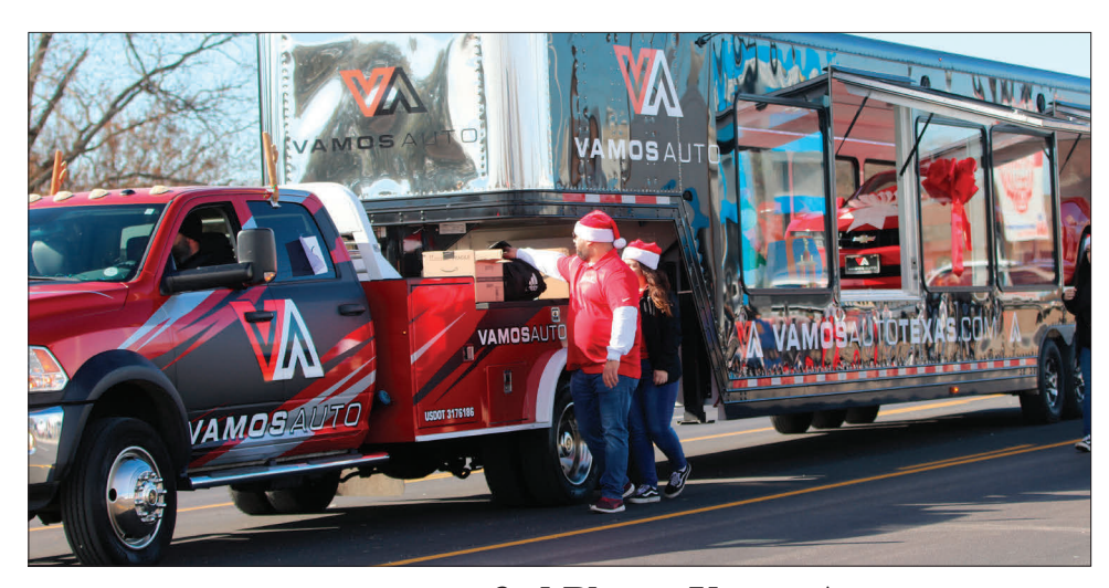
Grand Marshal - 3rd Place - Vamos Auto