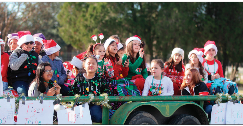
Best of Theme - JW Long Elementary

FOR MORE INFORMATION ABOUT THE TERRELL CHAMBER OF COMMERCE/CVB VISIT WWW.TERRELLTEXAS.COM