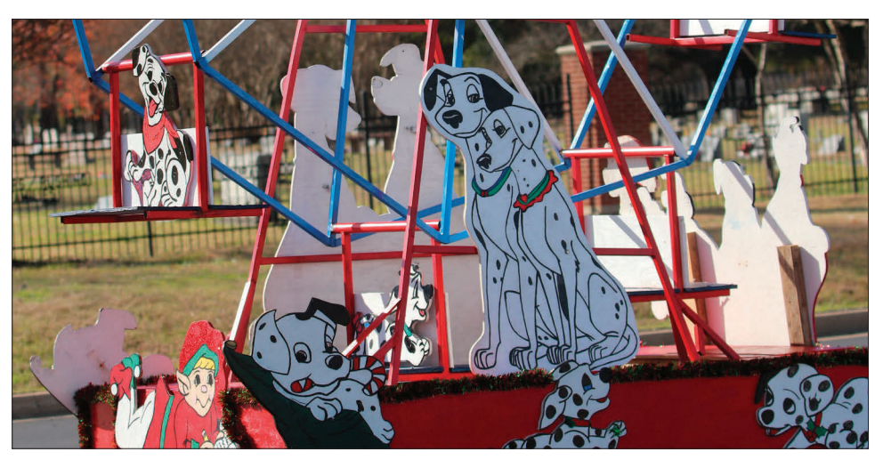
Grand Marshal - 2nd Place - U-Rent It Sales and Service