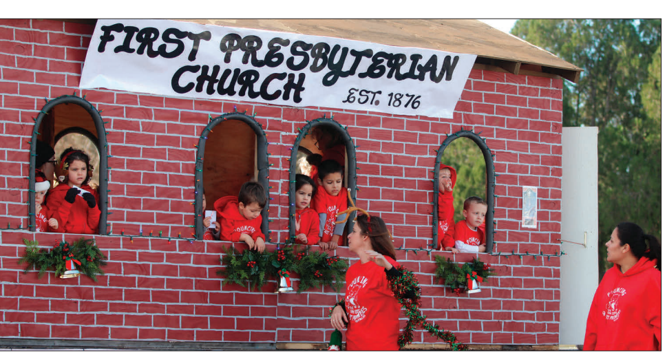
Best of Theme - Religious - 2nd Place -First Presbyterian Church Kindergarten