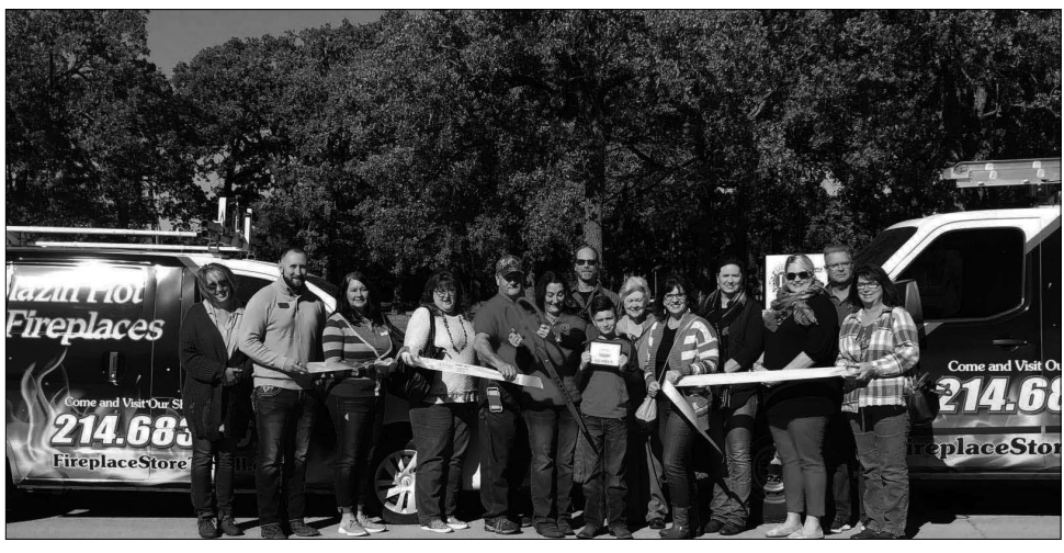
Blazin' Hot Fireplaces