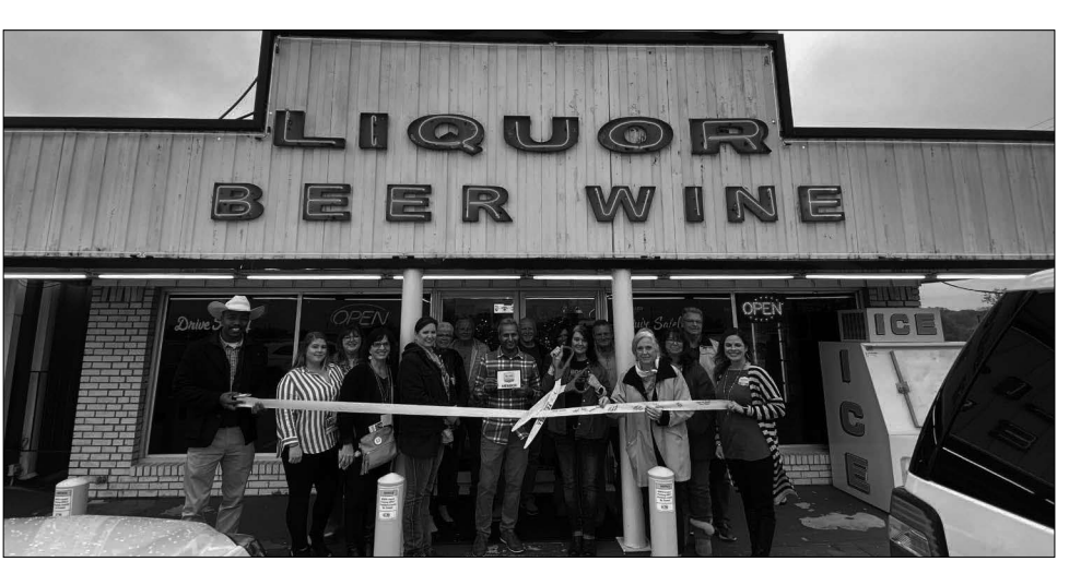
Boo's Beverage Center