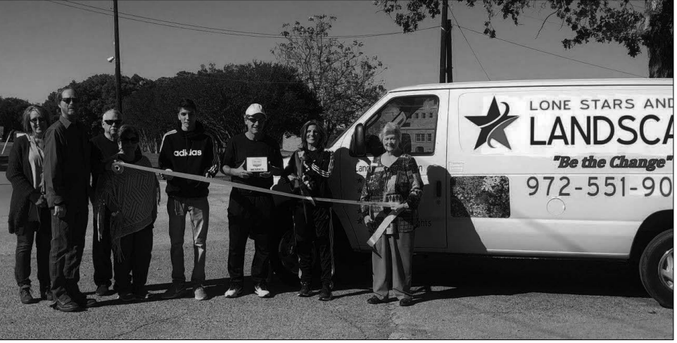
Lone Stars & Stripes Landscaping Company