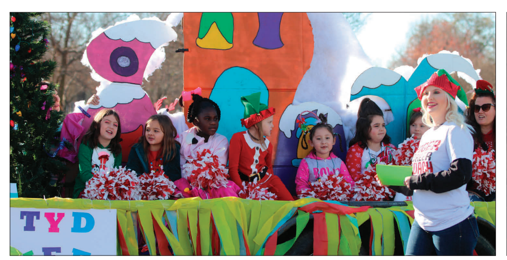
Junior Division - 2nd Place - TYD Cheer