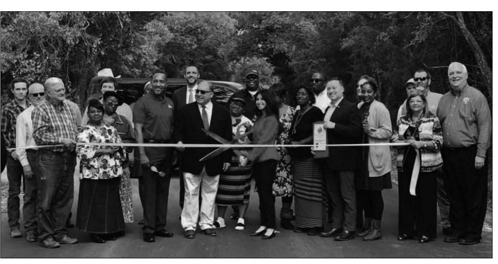
City of Terrell Rosehill Rd