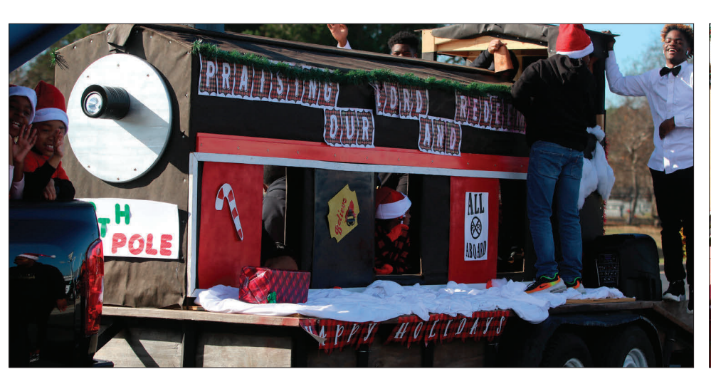
Best of Theme - Religious - 3rd Place - Calvary Temple Community Church