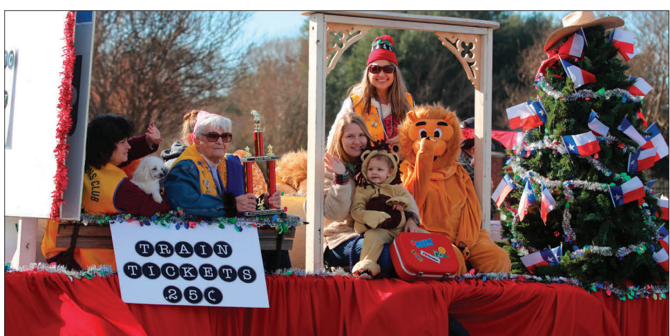
Best of Theme - 1st Place - Terrell Lions Club