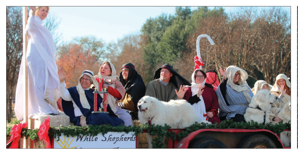
Best of Theme - Religious - 1st Place - Texas Great Pyrenees Rescue