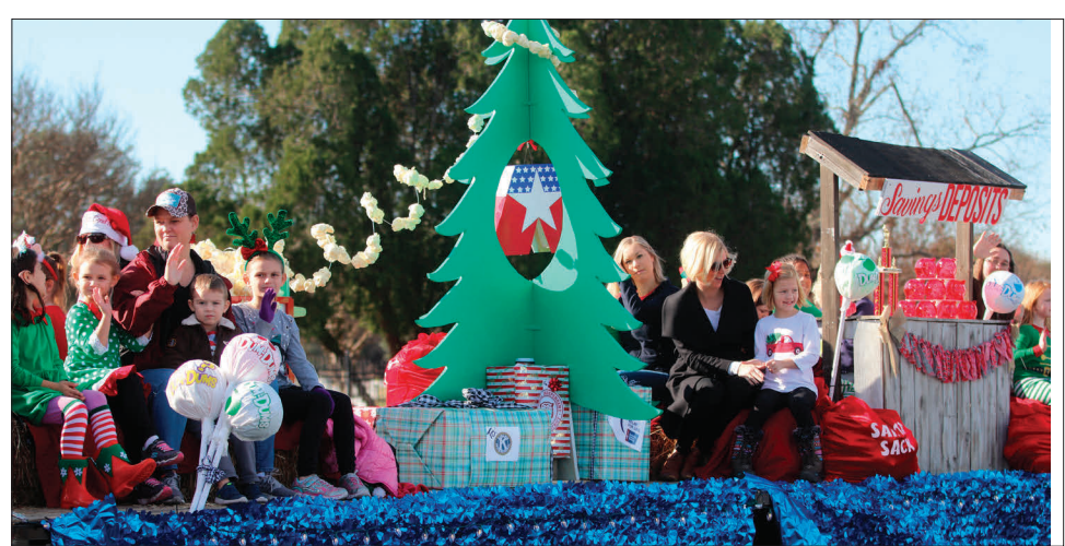
Best of Theme - American National Bank of Texas