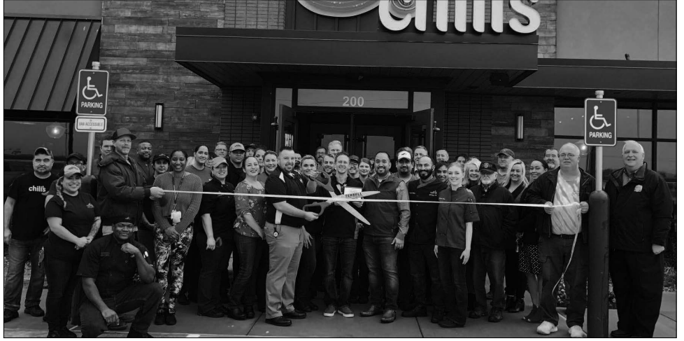
Chili's Grill & Bar