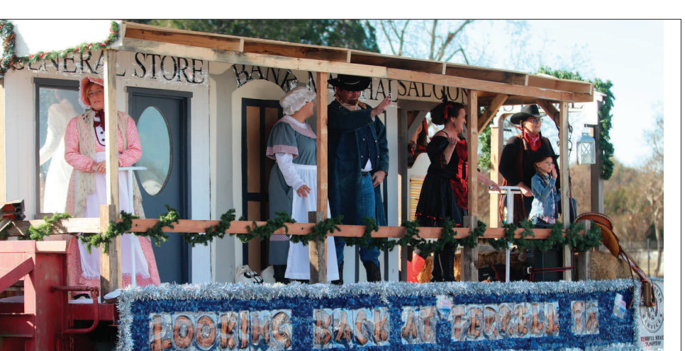
Terrell Chamber of Commerce/ CVB - Most Original Terrell State Hospital Volunteer Services Council