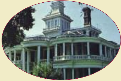
CARTWRIGHT HOUSE #27