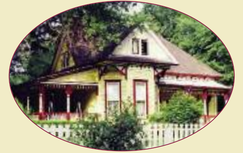
MCCLUNG/SYMMONDS HOUSE #56