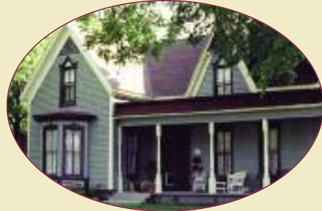
JOHN BASS HOUSE #22