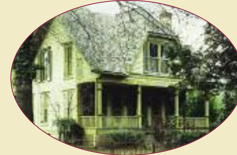
DR. L.E. GRIFFITH HOUSE #41