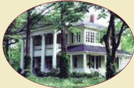
CRUZ/RAILEY HOUSE #45