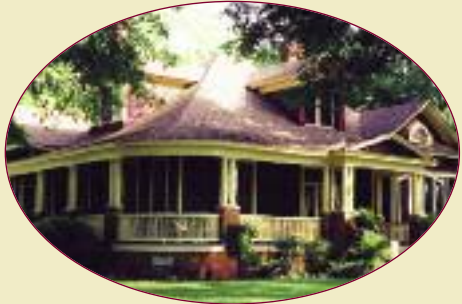
F.M. RAIKE HOUSE #40