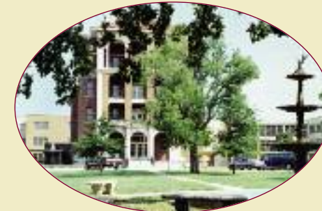
TERRELL STATE HOSPITAL #68