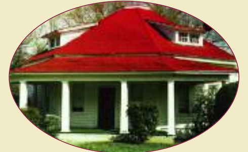
ROBERT A. TERRELL HOUSE #18