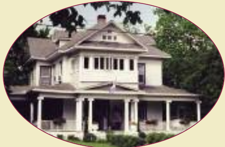
SEARS HOUSE #60