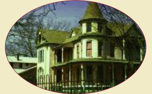
HARRIS BRIN HOUSE #20