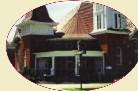
FIRST METHODIST CHURCH #21

Ranching has replaced farming as the primary activity, and historical as well as new homes make Terrell The City of Tomorrow with the Charm of Yesterday.