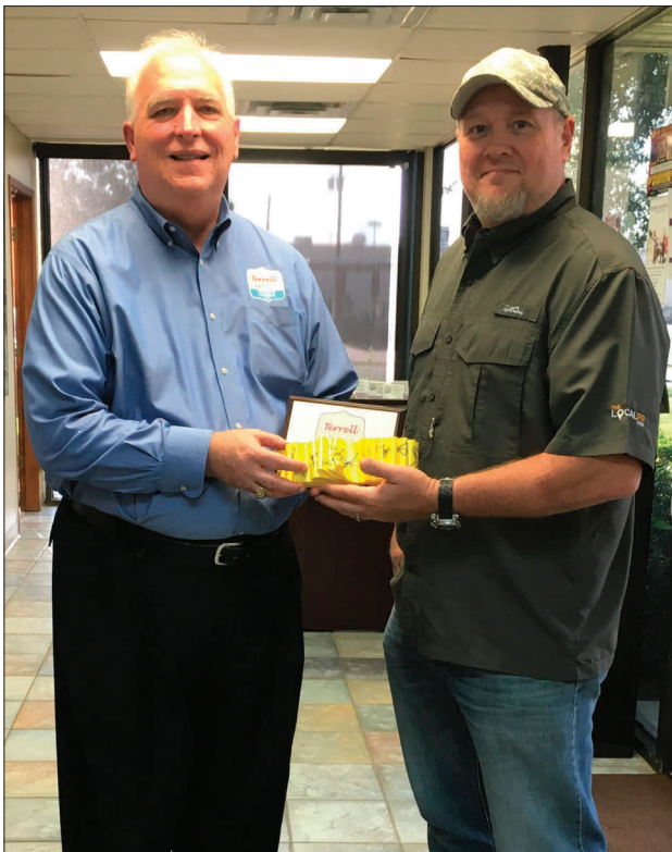
The Local PR Firm