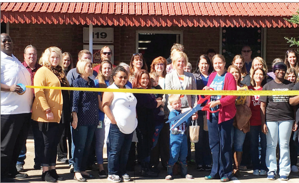
Whisked Away Bake House

FOR MORE INFORMATION ABOUT THE TERRELL CHAMBER OF COMMERCE/CVB VISIT WWW.TERRELLTEXAS.COM