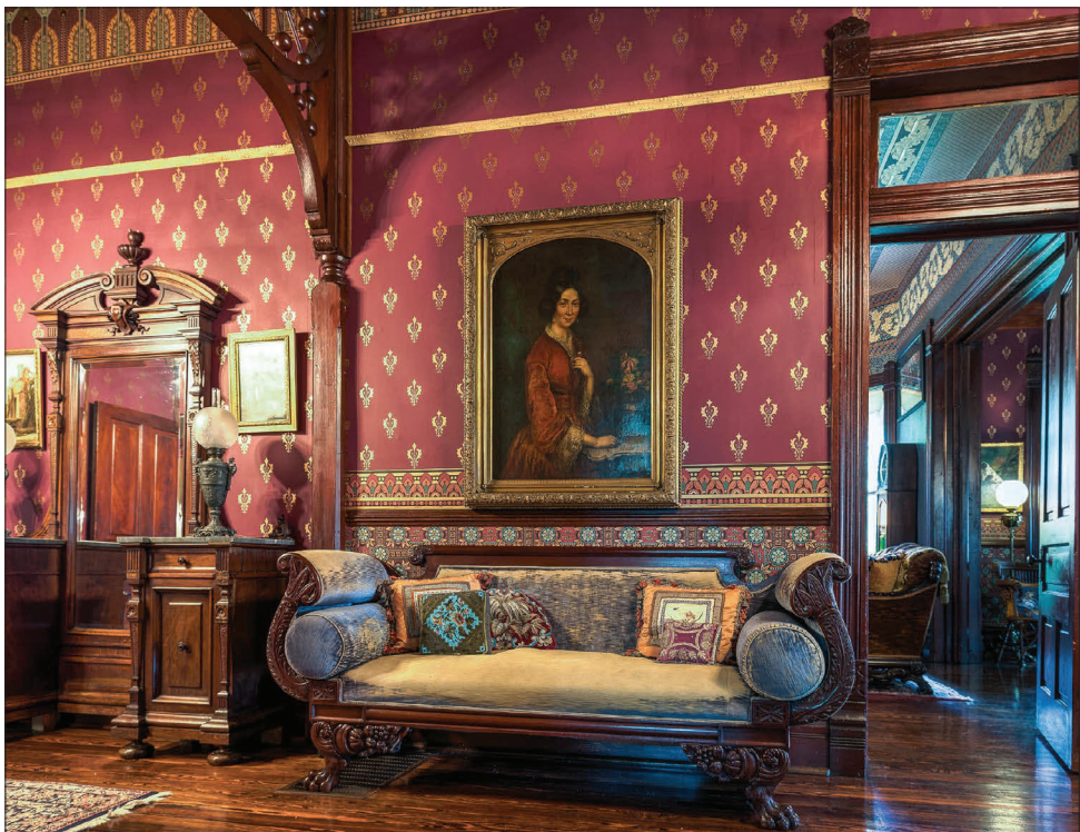
courtesy The DeBrow House located at 720 Griffith Avenue will be a part of the The Social Science Club of Terrell “Christmas in a Small Town” Tour of Homes on Dec. 1.