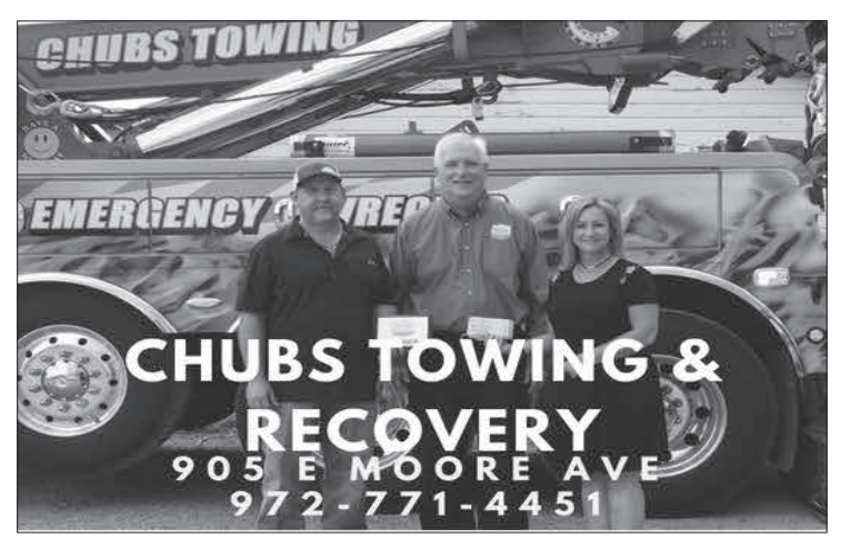
Chubs Towing & Recovery, Inx